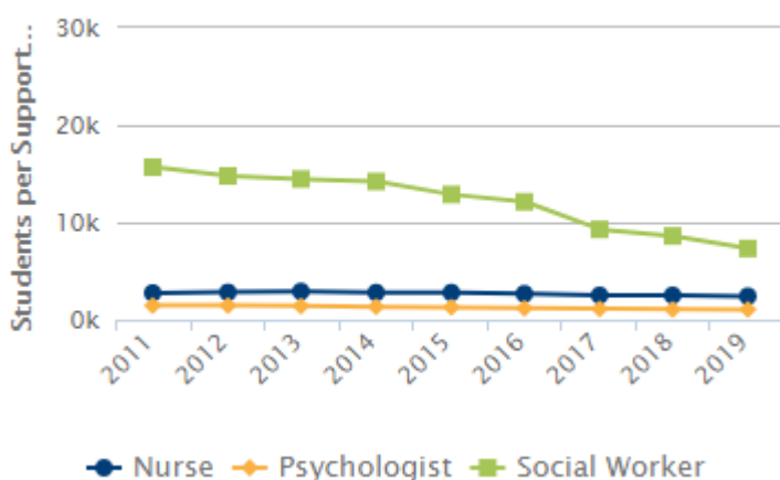
Ratio of Students to Pupil Support Service Personnel California

Definition: Ratio of public school students to full-time equivalent (FTE) pupil support service personnel, by type of personnel (e.g., in 2019, there were 2,410 students for every FTE nurse serving California public schools). Smaller numbers indicate that students have greater access to support service personnel.